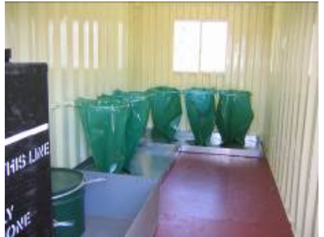
INSIDE CONTAINER WASTE FACILITY

The project was initiated with the assistance of the City of Cape Town, who permitted ROSE to place these containers at some of the Garden Refuse Sites.