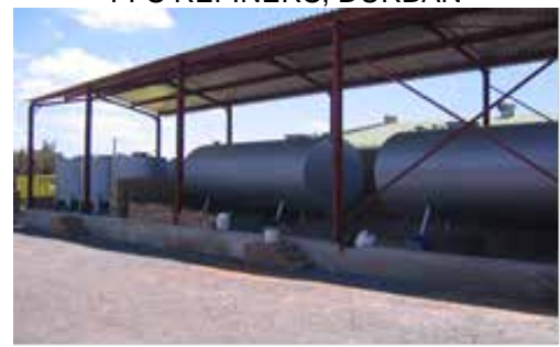
OIL SEPARATION SOLUTIONS, MIDDELBURG

All facilities have separators to ensure that all effluent leaving the plants meet local municipal by-law effluent discharge standards. ROSE conducts annual audits through independent consultants to ensure environmental and legal compliance.