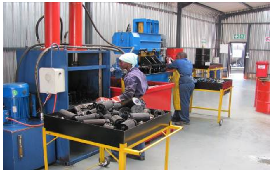
Oil filters being prepared for disposal

As an additional service to their customers, NORA-SA collectors also collect used oil filters for safe disposal. They are paid an incentive by ROSE to subsidise their transport costs.