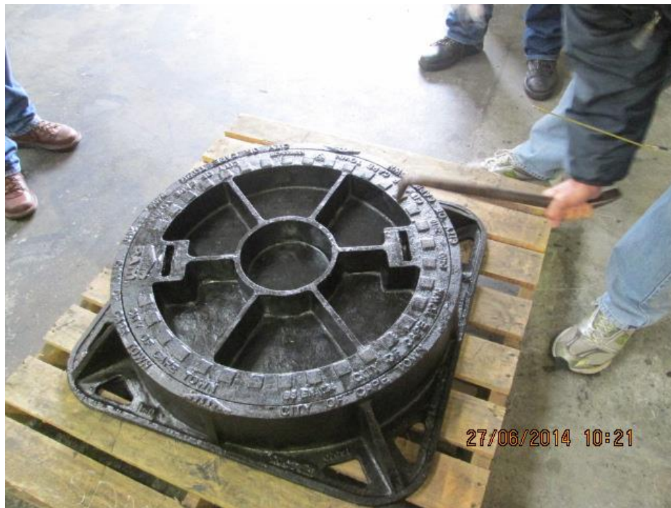
Photo 4: Different methods of casting allowing for covers to be filled with concrete to lessen the scrap value.