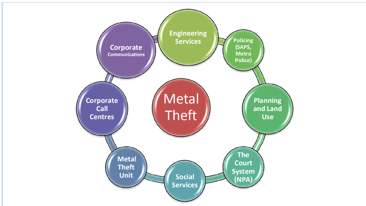
Figure 1. Departmental cooperation that is needed to deal with a common problem.