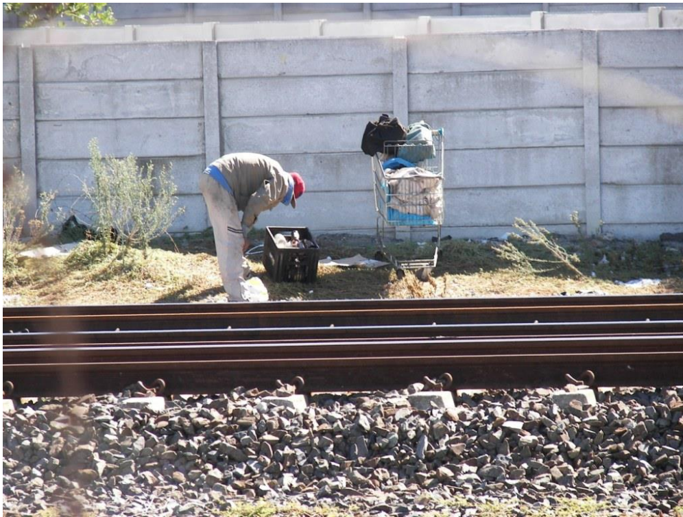
Photo 2: The collection of scrap metal has become a common sight in the urban environment, even active rail reserves.