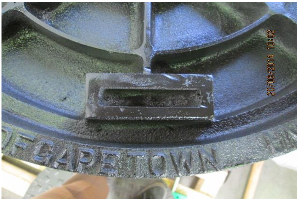
Photo 3: New Manhole Covers and Frames clearly marked during the casting process