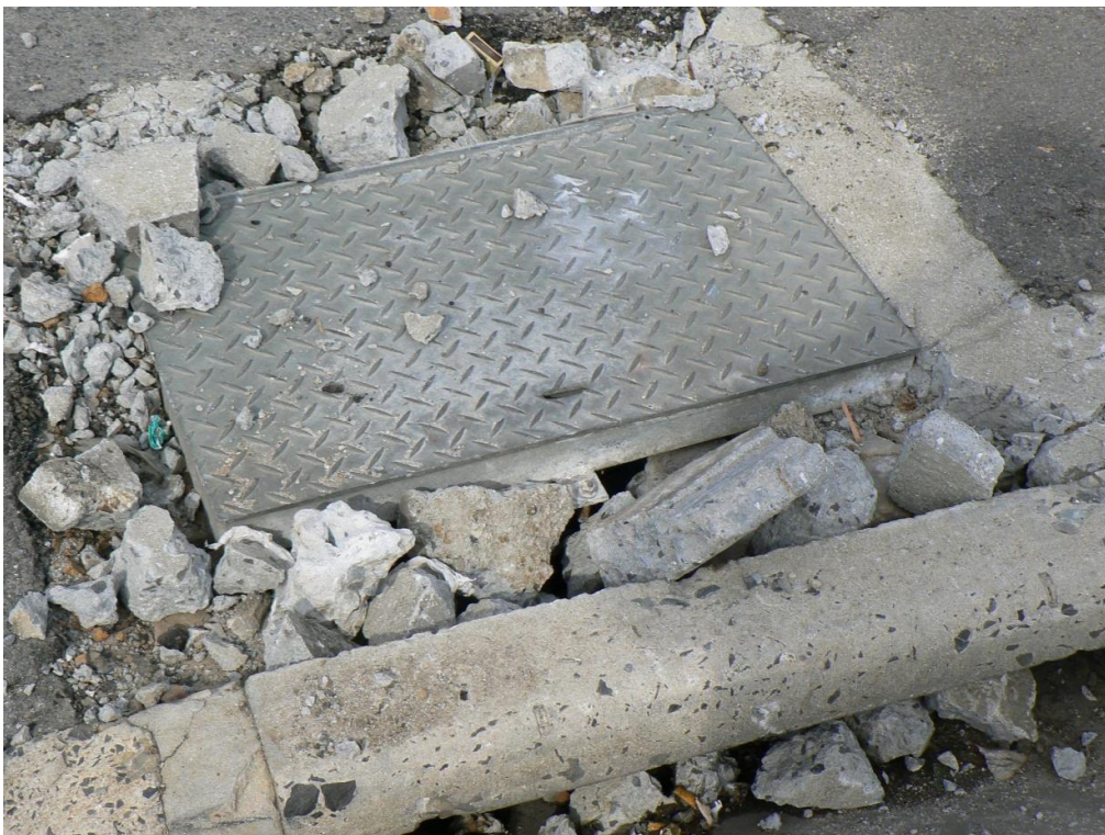
Photo 1: All metal has become targets of metal thieves even with the switch to galvanized iron